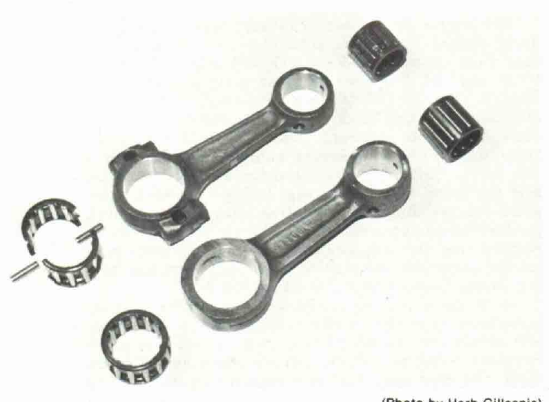
FIGURE 1 — Comparison of single-piece con rod with two-piece design. 34 AUGUST 1976

Life of the hard-chrome has been estimated at 400 hours in chain saw use before it wears through. The