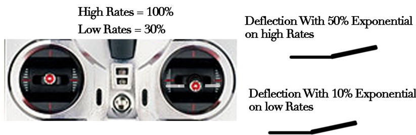
Fig 4: Full deflection